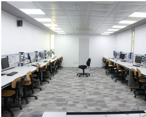
Computer Engineering Lab