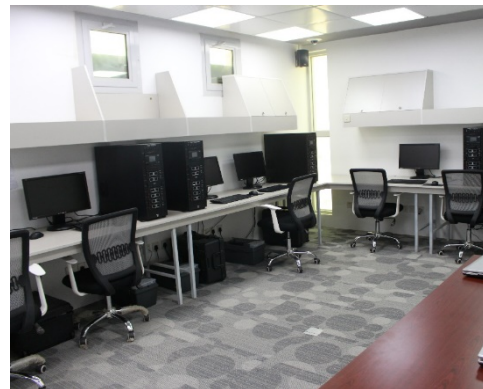
Digital Forensics Lab