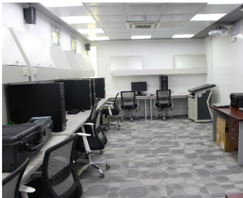
Digital Forensics Lab