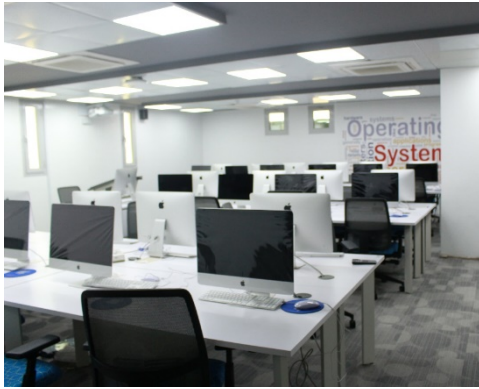
Operating Systems Lab