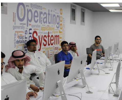
Operating Systems Lab