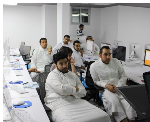
Operating Systems Lab