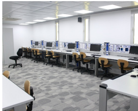
Computer Engineering Lab